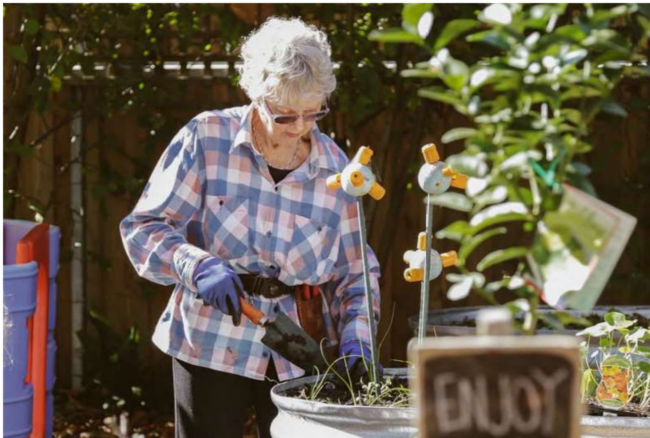
Community garden at the Alphington Community Centre