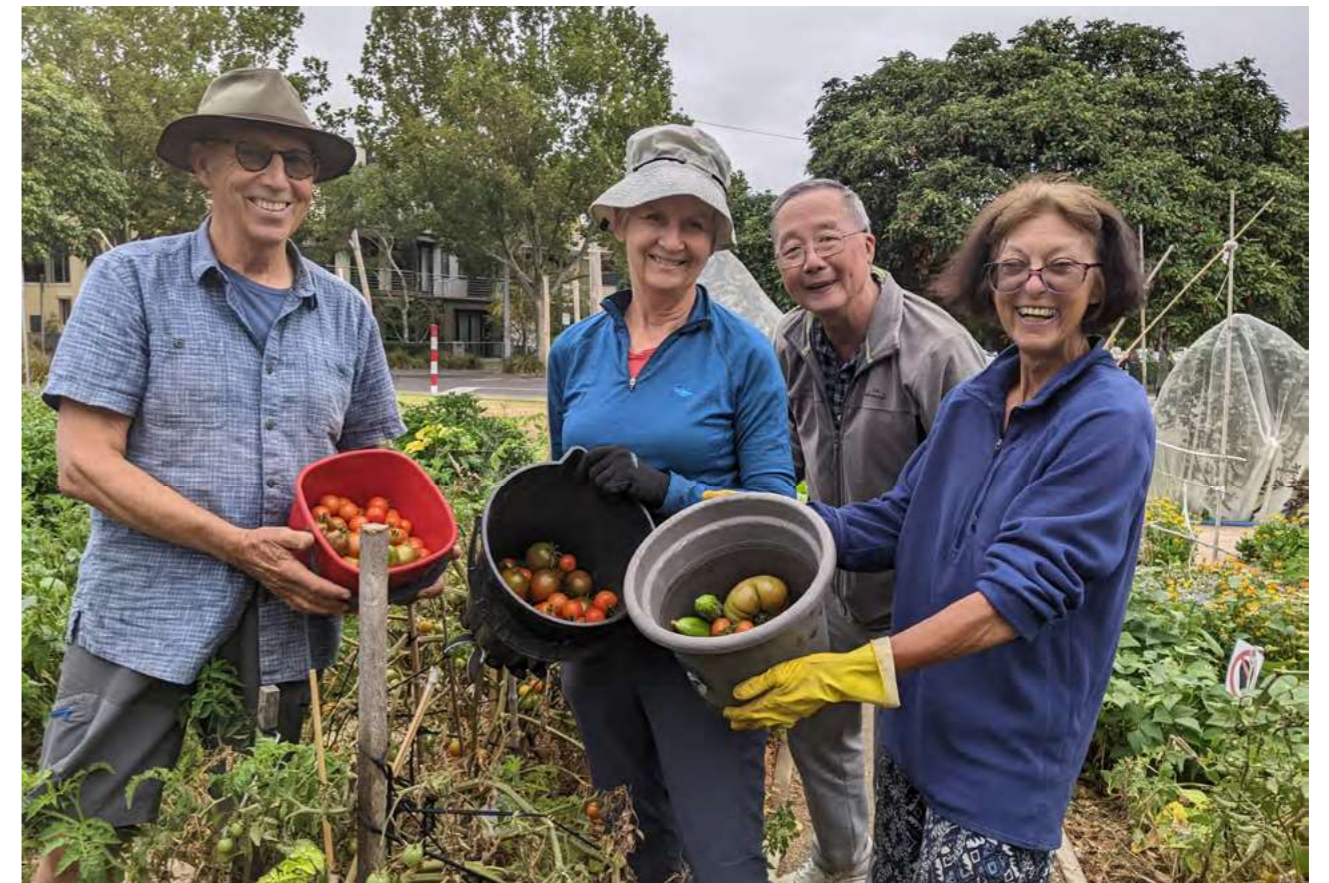
Community garden at the North Carlton Railway Neighbourhood House

As a collective, the Yarra Neighbourhood House Network is able to strengthen our capacity for action and amplify the influence of each of our individual houses. By building collective knowledge around community needs and issues and sharing skills and expertise, we are constantly innovating and growing. Through the development of this shared Climate Action and Resilience Plan , we are developing a mutual understanding of the impacts of climate change on our local communities and a shared commitment to embedding sustainability and resilience across our houses and communities.