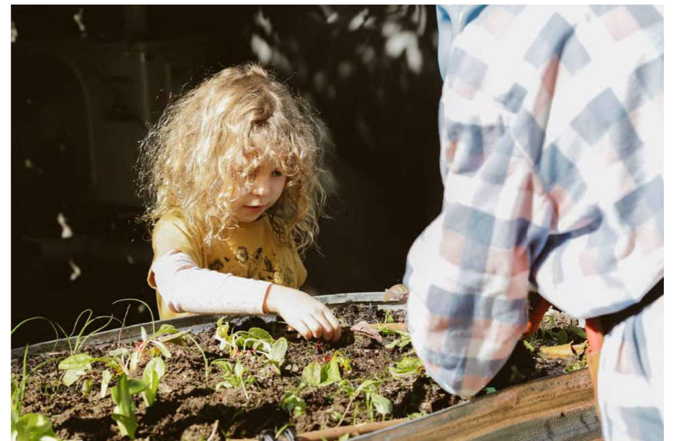
Community garden at the Alphington Community Centre