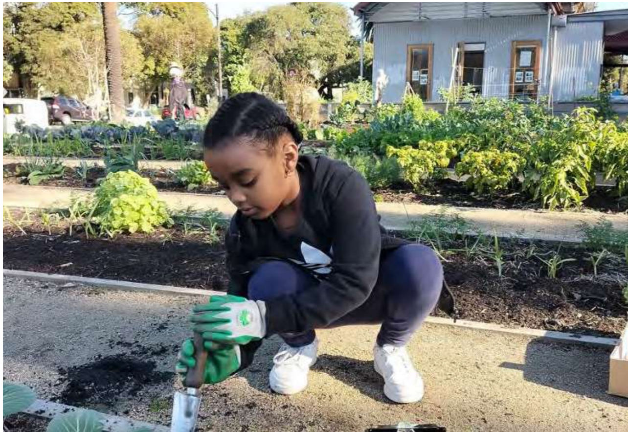
Community garden at the North Carlton Railway Neighbourhood House