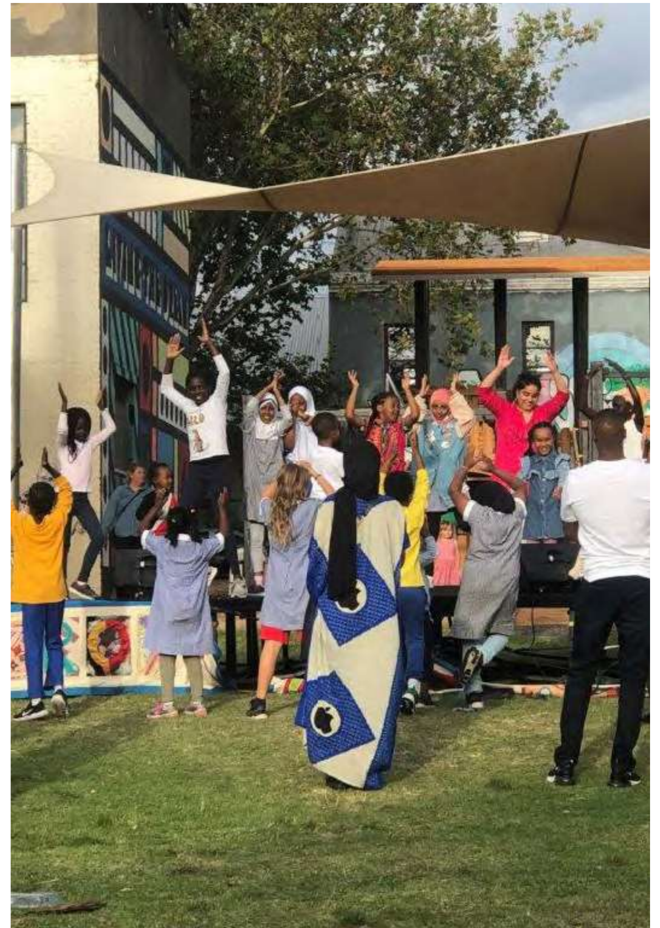
Community event at the Fitzroy Learning Network