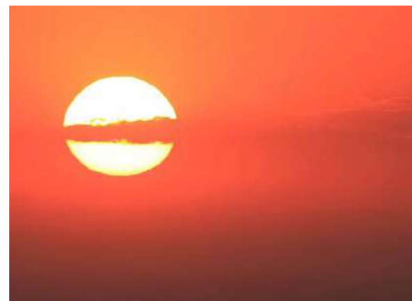
Extreme heat events are occurring with greater frequency and severity

capacity through learning and social opportunities. Our core work includes the promotion of social and emotional well-being, delivery of physical wellness programs, respect and protection of the natural environment, and economic and educational inclusion. Our houses are more than just physical spaces that provide material support; our deep, diverse, and long-standing connections within and across Yarra mean they are places that inherently build community resilience. Every day, our neighbourhood houses provide support for people who, due to their circumstances and the way our city and systems are designed, are more at risk to the impacts of climate change. Simultaneously, our houses are committed to sustainability and play an active role in facilitating and embedding sustainability actions across our local communities.