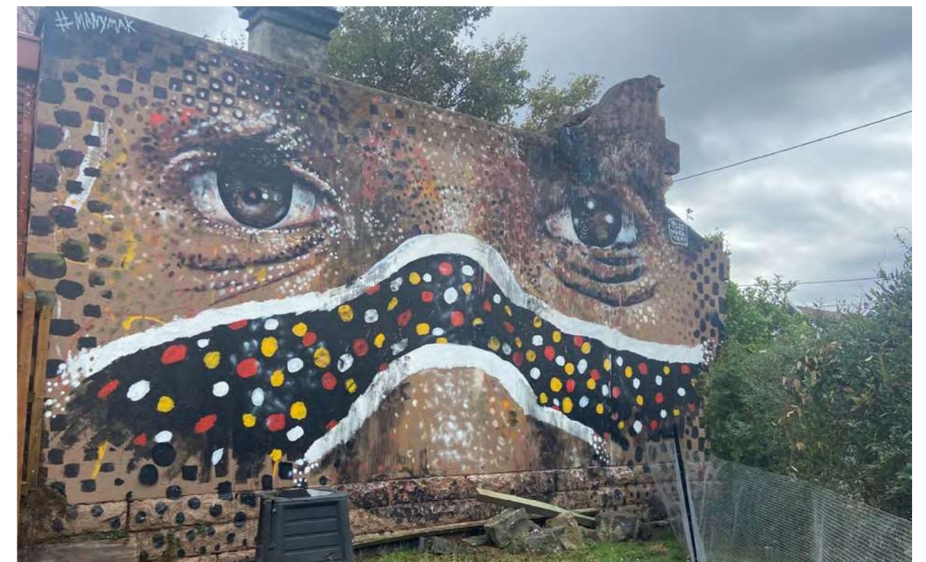
Ballum Ballum garden at the Carlton Neighbourhood Learning Centre